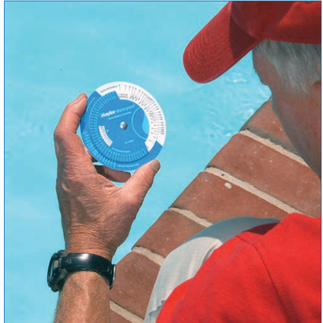
Manage pool chemistry with the aid of Taylor's Watergram Water Balance Calculator.

All but the mathletes among us find the Saturation Index calculation daunting. To simplify the process, many years ago Taylor developed a circular kind of slide rule to do the number crunching. We called it the Watergram® Water Balance Calculator.